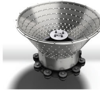
10-Point Suspension with Basket