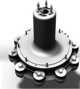
Internal 10-Point Suspension without Basket